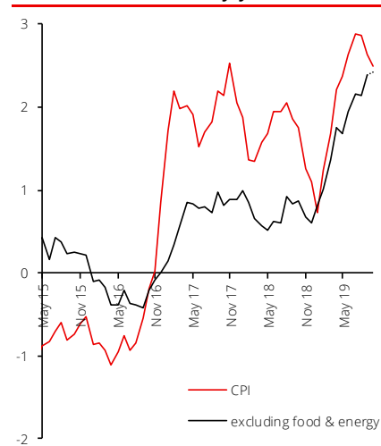
CPI and core inflation, %y/y